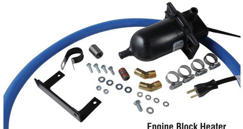
Engine Block Heater

Model: 006560-0 - 15 & 20 kW UPC: 696471065602