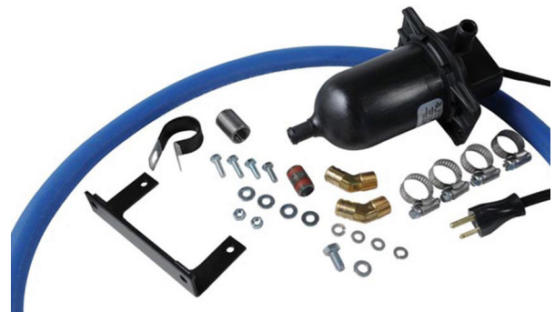
Engine Block Heater